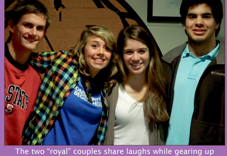
for the assembly and dance.